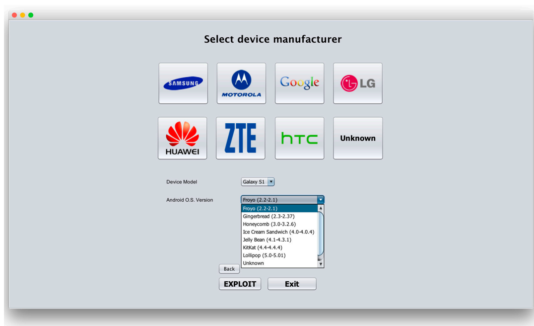
Figure 2. CellIntel prototype user interface during data extraction of an Android smartphone.

The empirical testing performed during the study showed positive results in producing the prototype using the aforementioned techniques. The prototype has similar functionality and improved usability when compared to rivals. After the collaborative hardware and software design described in the previous sections, the CellIntel prototype was produced with a S250 Tiertime 3D printer and was then manually assembled. Subsequently, the software was installed on the device (Figure 2).