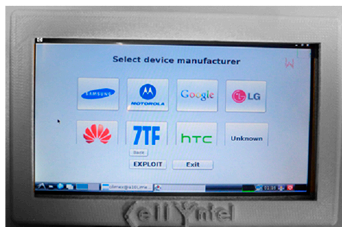
Figure 4. CellIntel assembled prototype in function: touch screen user interface during the choice of the device to be imaged.

Finally, data extractions for forensics investigations, performed with the prototype device CellIntel , were successful with both Android and iOS devices (Figure 4).